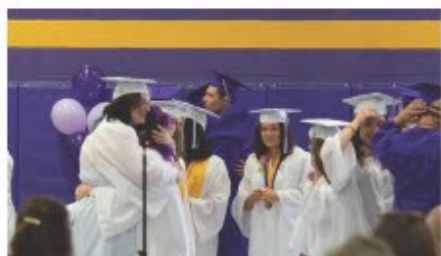
Class of 2023 Graduates celebrate after their Commencement ceremony.