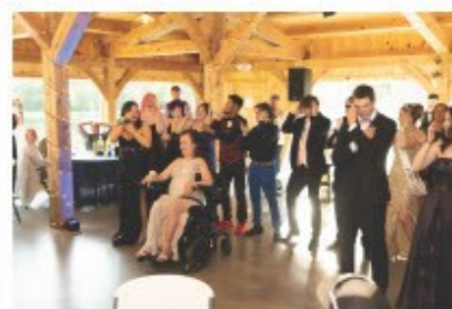
Members of the Senior Class dance the Macarena at the 2023 Prom.